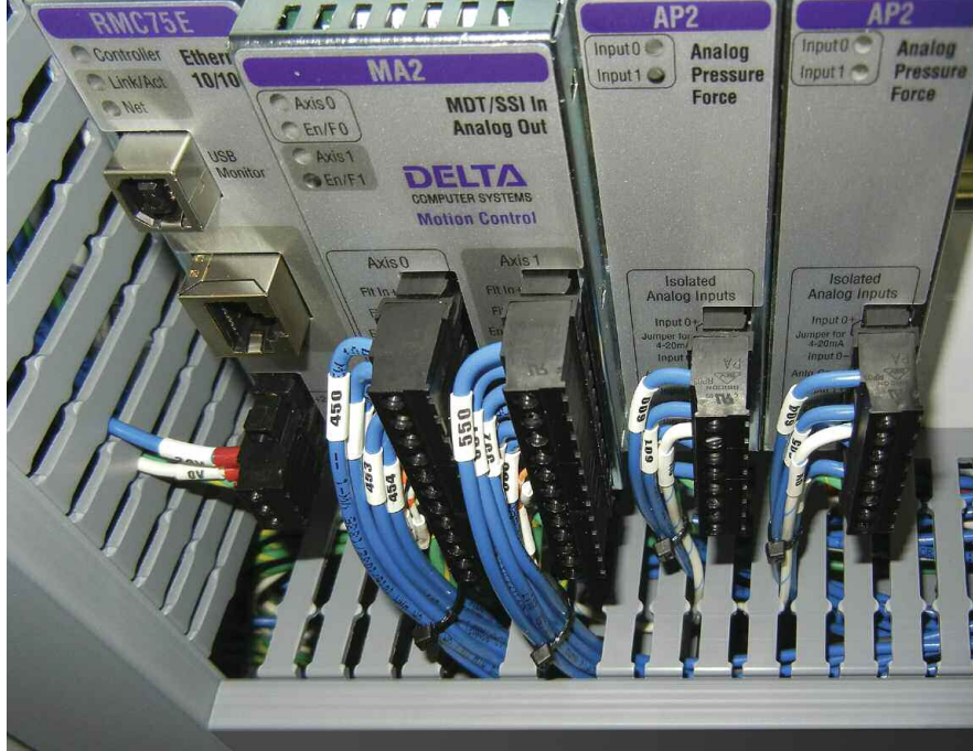
This two-axis electrohydraulic motion controller, used in the hydraulic-press control upgrade described here, combines processing power with Ethernet communications and a USB monitor port.